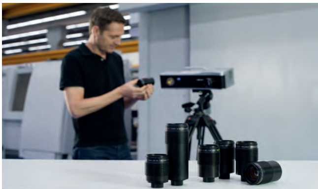
The right sensor for every application: Customize the measuring field (45 - 500 mm) quickly by simply changing the lens

The high-performance software platform colin3D ensures a consistently efficient and project-oriented procedure during the entire measuring process.