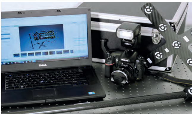
ZEISS COMET Photogrammetry: compact hardware for large measurement volumes

Get your complex 3D digitizing projects done more efficiently! With our new, integrated photogrammetry equipment for the acquisition of 3D reference points, a cost-effective system solution featuring easy handling and high accuracy is now available. The high-performance software platform colin3D ensures a consistently efficient and project-oriented procedure during the entire measuring process.