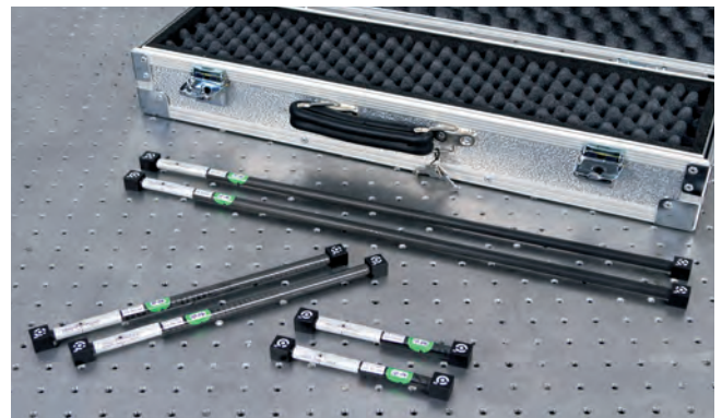
Extensive accessories (e.g. scales, adapters, W-LAN kit) for system adaptation to individual measurement tasks