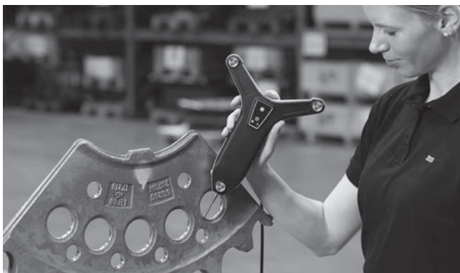
The hand-held ZEISS T-POINT touch probe – the ideal portable coordinate measuring machine for simple single-point measurements

Outstanding technical features, e.g. the high dynamic range for scanning on diverse object surfaces and a hitherto unmatched data rate, allow for an unparalleled scanning speed and precise measuring results.