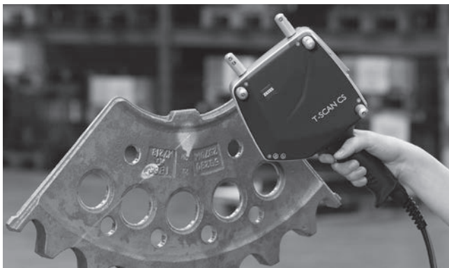
Quick and intuitive 3D data capture with the hand-held ZEISS T-SCAN laser scanner

Fast, intuitive and highly precise 3D scanning – the hand-held ZEISS T-SCAN laser scanner is a complete solution, achieving a new dimension in coordinate measuring technology. With its perfectly matched components (tracking camera, hand-held scanner and touch probe), this modular system offers maximum flexibility for many different applications. The high-performance colin3D software platform ensures a consistently efficient and project-oriented workflow during the entire measuring process.