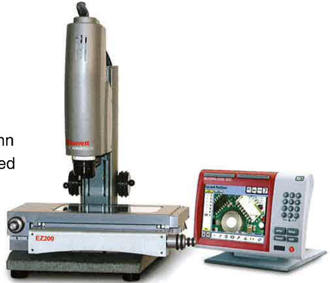
The EZ200 (above) and EZ300 (left) are also available in a CNC version with the QC300 package.

A precision mechanical bearing X-Y-Z stage and column translates data accurately and repeatably to a dedicated geometric readout.